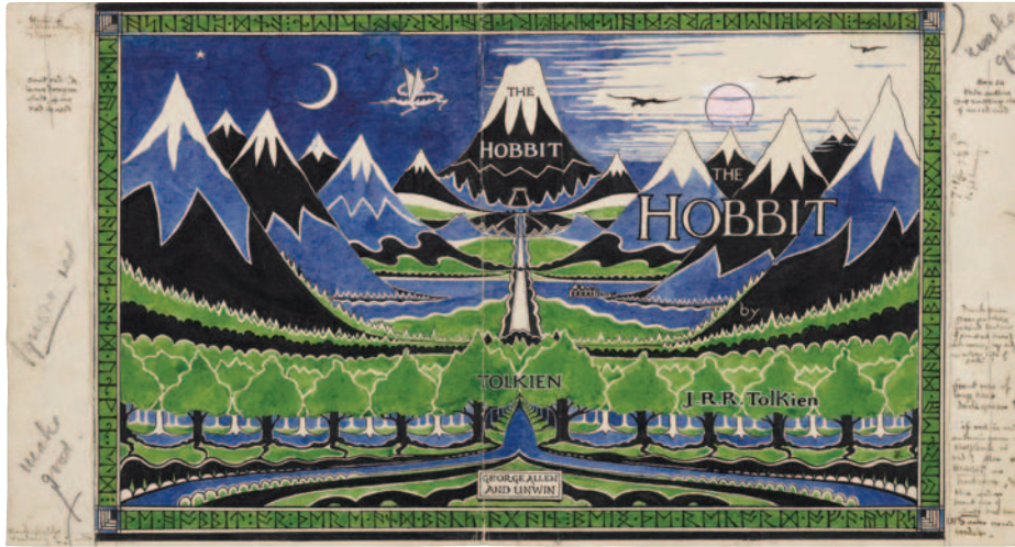
J.R.R. Tolkien (1892–1973), Dust jacket design for The Hobbit (1937), pencil, black ink, watercolor, goache. Bodleian Libraries, MS. Tolkien Drawings 32. © The Tolkien Estate Limited 1937.