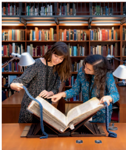
Sherman Fairchild Reading Room, The Morgan Library & Museum, Photography by Graham S. Haber. 2018.

The Sherman Fairchild Reading Room welcomed academics, students, curators, librarians, writers, artists, musicians, and independent scholars from all over the world. Researchers studied over 9,000 items across every curatorial department, and thousands more made queries by e-mail and telephone. Project topics included ceremonial architecture of the Alevi Muslim minority in Turkey,