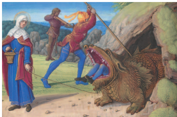
The Taming the Tarasque, from Hours of Henry VIII, France, Tours, ca. 1500. The Morgan Library & Museum, MS H.8, fol. 191v, detail.

California artist Wayne Thiebaud (b. 1920) has been an avid and prolific draftsman since he began his career as an illustrator and cartoonist. Featuring subjects that range from deli counters and isolated figures to dramatic views of San Francisco's plunging streets, Thiebaud's drawings invariably endow the most banal, everyday scenes with a sense of