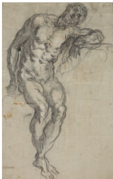
Tintoretto (1518–1594), Study of a seated nude , ca. 1549, black and white chalk on blue paper. Louvre 5385