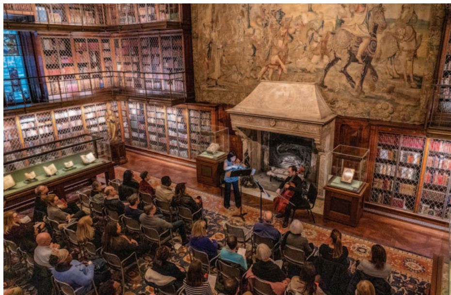
Rush Hour Concert, Call & Response: Chamber Music by African American Composers Members of the Chamber Orchestra of Philadelphia, March 19, 2019.