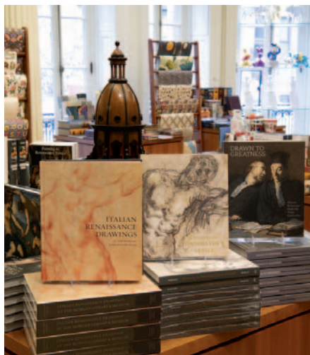
The Morgan Shop: Italian Renaissance Drawings , Drawing in Tintoretto's Venice , and Drawn to Greatness publications.

The Joseph Rosen Foundation continues to provide generous underwriting support for the Department of Ancient Near Eastern Seals and Tablets.