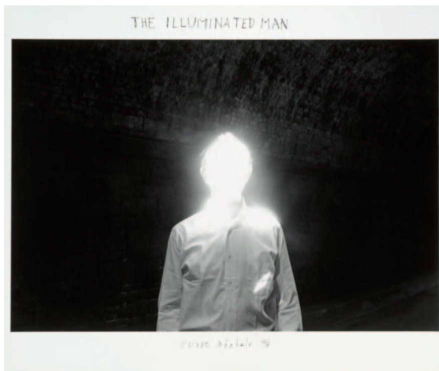
Duane Michals (b. 1932), The Illuminated Man, 1968. Gelatin silver print. Purchased on the Photography Collectors Committee Fund 2018.37.