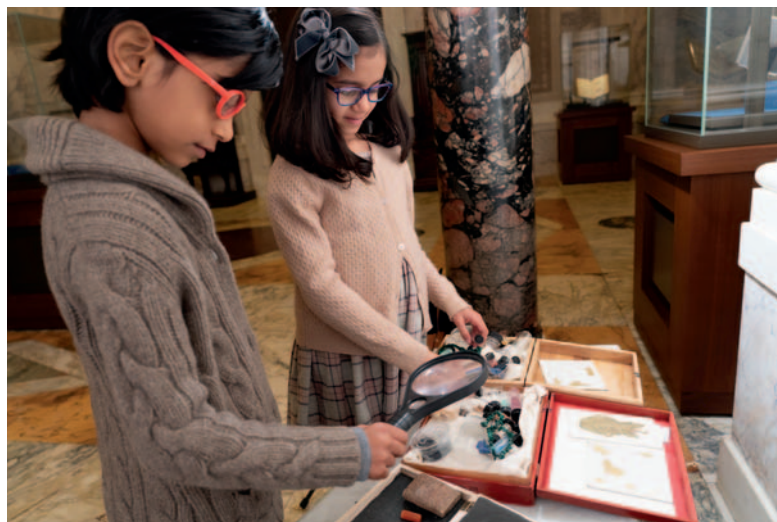
Morgan Explorers, Family Drop-in Museum Experience, Rotunda.

The Morgan Book Project marked its tenth year, serving 28 schools during the 2018-19 school year, and was adapted to include District 75 schools that provide highly specialized instructional support for students with significant challenges. The Morgan Book Project Award Ceremony was held in May 2019, culminating in a one-day installation for all winners followed by a four-week exhibition showcasing a selection of student books. The program, offered free