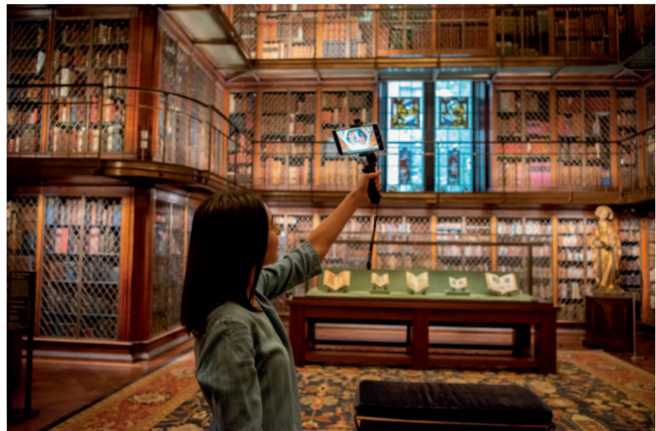
Augmented reality tour, J. Pierpont Morgan's Library.